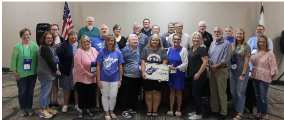
Attendees at this year's Legislative Summit, held in Huntington, pause their work for a photo.

The group's recommendations were used to draft a concise Legislative Agenda, which was approved by delegates at the 2023 AFT-WV Convention in November in Morgantown. To read the full 2024 Legislative Agenda, visit www.aftwv.org .